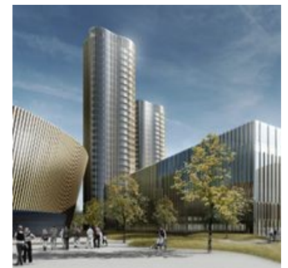
Sportarena Allmend, Luzern