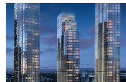
One Nine Elms, London