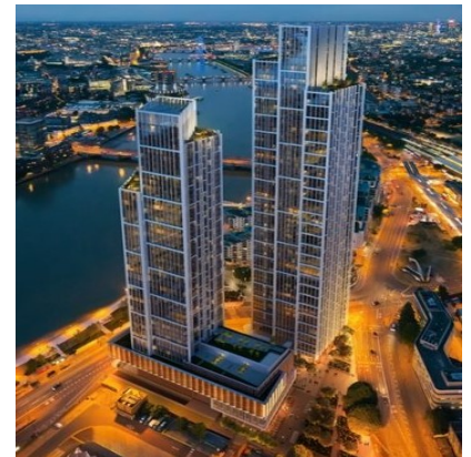
One Nine Elms, London

Tel. +41 61 555 23 85, www.yuanda-europe.com